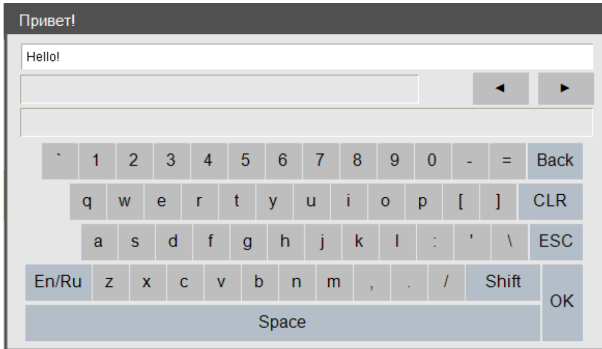
English lowercase keyboard