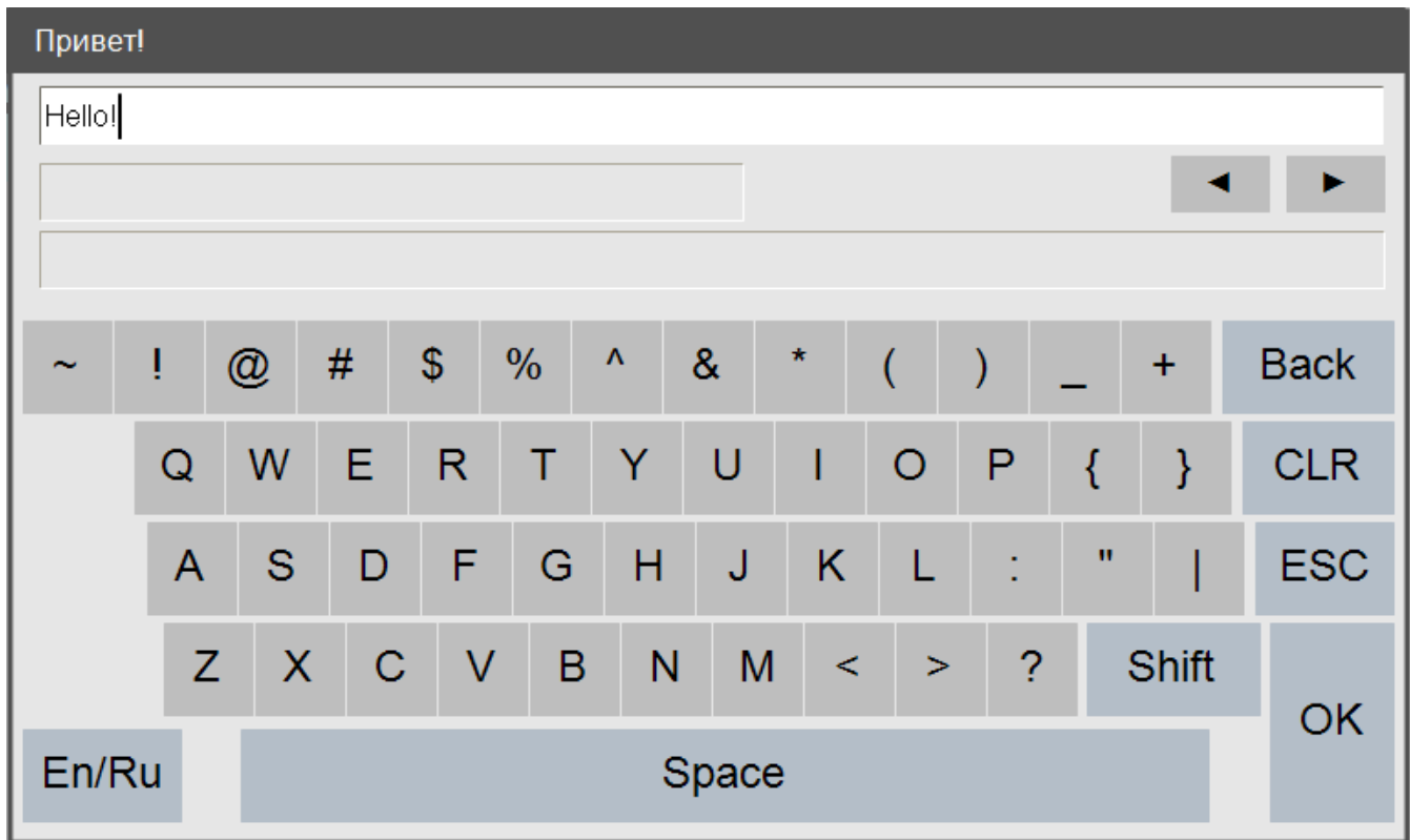
English uppercase big keyboard