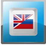
English/Russian keyboard dialog